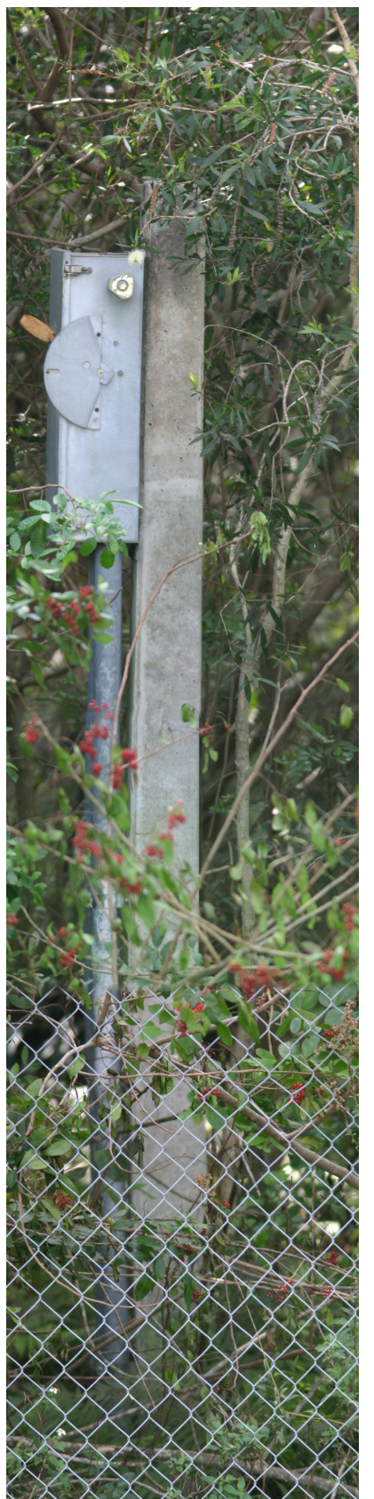
Photo #2 This is a composite photo showing the smaller pole that is adjacent to the power pole in front of the eagle nest. It is about 8-10 feet tall. Note the wooden switch handle protruding to the left, and the electrical conduit emerging from underground. This structure is located on City of Pembroke Pines property. It looks quite old, perhaps a remnant from the former owner of the property. The fact that the power pole contains a transformer suggests that a service line is (or was) in place.